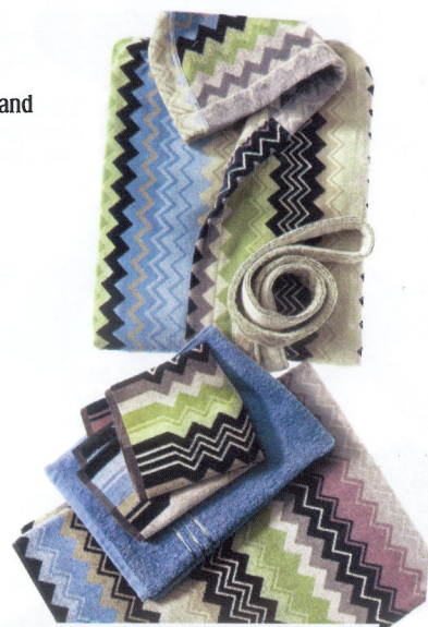
Giacomo hand towel, £11; bath towel, £33; bath sheet, £68 and robe, £140, all by Missoni @ Bedeck Home, Lisburn Road, Belfast and The Linen Green, Dungannon