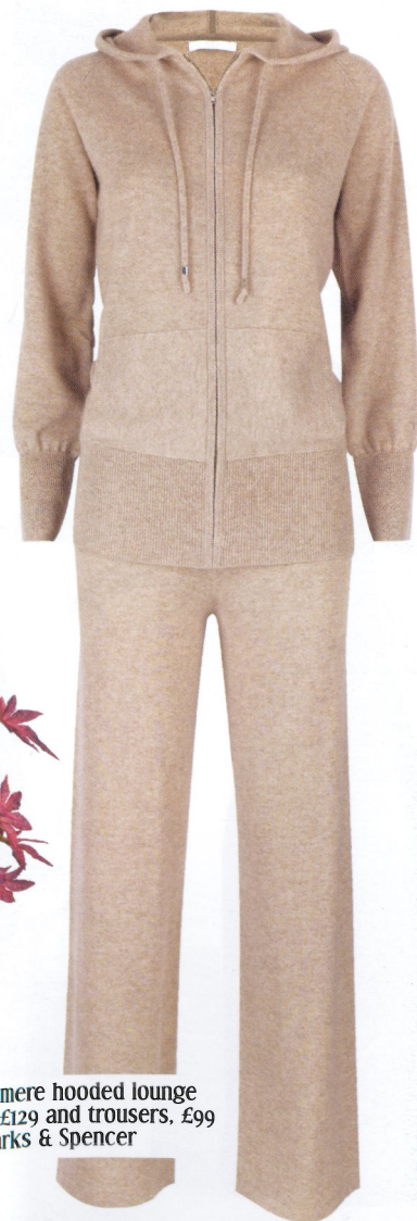
Cashmere hooded lounge suit, £129 and trousers, £99 @ Marks & Spencer