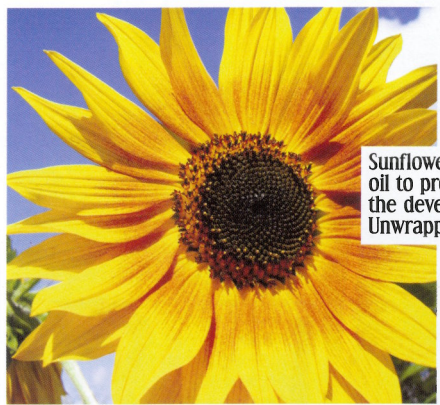
Sunflowers (grown and pressed for oil to provide valuable income in the developing world), £16 by Oxfam Unwrapped @ www.oxfamireland.org