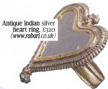
Antique Indian silver heart ring, £320 ( www.rabari.co.uk )