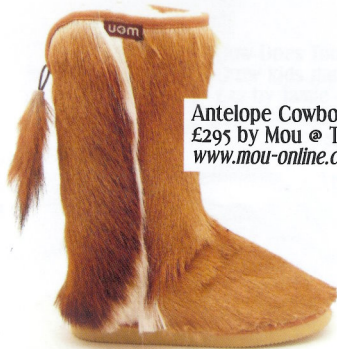
Antelope Cowboy boots, £295 by Mou @ TopShop and www.mou-online.com