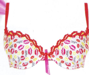
Lippy bra, £18 and shorts, £8 by Miss Ultimo @ Debenhams