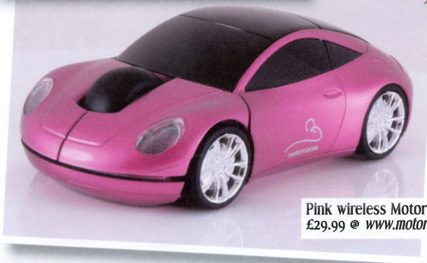
Pink wireless Motormouse, £29.99 @ www.motor-mouse.net